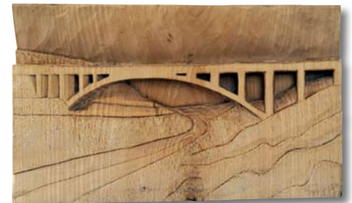
M62 Motorway, by Reg Platt

For the Overgate Panel, a sub-committee of the club agreed the overall design and arranged for the timber to be cut into appropriate sizes for distribution amongst the carvers. Each carver was given freedom to alter items slightly to facilitate carving practices. The overall finished dimensions of the panel and frame were agreed at approximately 3 x 1m (9ft 6in x 3ft 6in) but because of its final location in the main entrance way