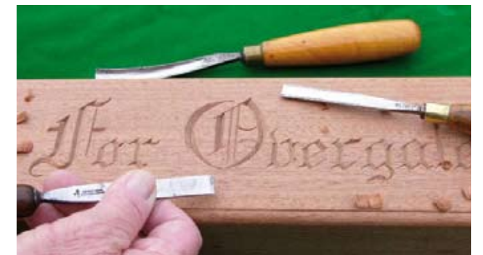
Plaque text "For Overgate" being carved

The members of the West Riding Woodcarvers' Association are indebted to the Foundation for a grant of £1,570 to assist with the purchase of the limewood for the individual carvings, the utile timber for the frame, specialist lighting over the panel at Overgate Hospice, and fixing materials. ▶