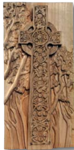
War Memorial, by Margaret Myatt

To accompany the panel and assist in raising funds for the Hospice, a full colour booklet was designed and compiled by the club members depicting each of the individual carvings and giving a brief outline of the background to each scene within the panel. The photographs for the booklet were kindly taken by the Halifax Photographic Society and the cost of professional printing came to just over £800 for 2,000 copies. Through sales