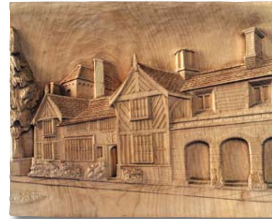
Shibden Hall, by David Holt

at £3 each, mainly while the panel was on display at the Town Hall, and after the subtraction of costs, the club was able to donate over £1,200 to the Hospice's general fund. The booklets are now displayed with the panel and contribute a small but steady source of funding to the hospice.