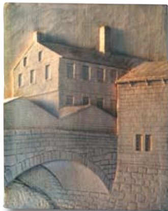
Gibson Mill

The degree of experience amongst the thirty-six carvers varied from individuals who had been carving in all forms for many years, to the complete novice with very little experience. The club, which now boasts approximately seventy members, has recently launched its own website – www.wrwoodcarvers.com – depicting members' carvings and details of club projects.