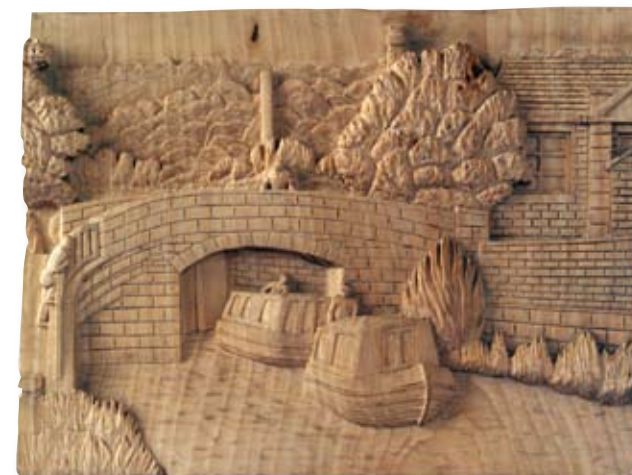
Barges on the Canal

to the Jura Mountains, and is just an hour's drive from the Swiss border.