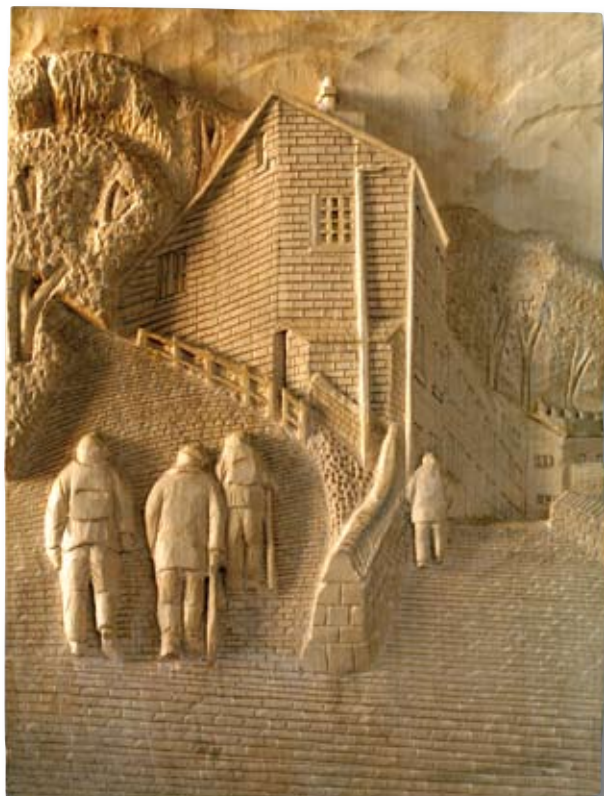
The Buttress, by Maurice Oldale