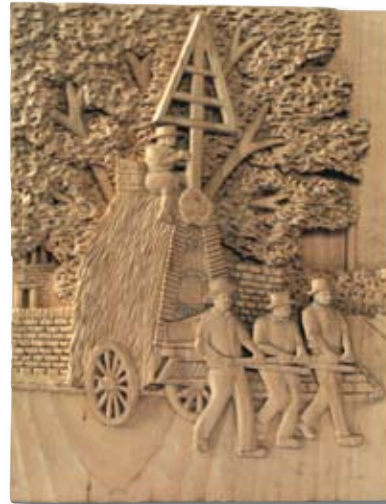
Rushbearing, Sowerby Bridge, by Mike Chambers

On completion, the forty-one carvings were to be treated with a liquid sealing compound to protect the wood from the elements and to ensure that little maintenance is required. The frame wood of utile ( Entandrophragma utile ) was machined, planed, rebated, mitred, sealed and waxed to a deep red-brown colour to contrast with the mellow tones of the finished