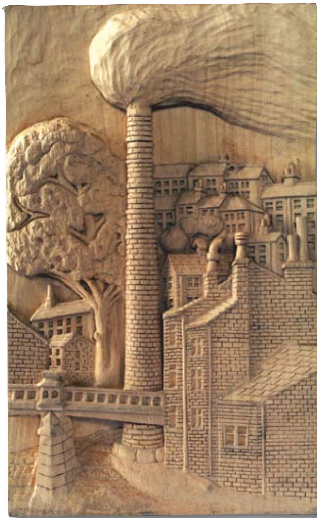
Mills, Hebden Bridge, by Derek Lindley

A number of pictures and photographs were collected, and the most suitable to fit the dimensions of the cut timber were photocopied for distribution. Two photocopies were given to each carver: one for reference throughout the carving process and one to be affixed onto the limewood block to facilitate carving and perspective.