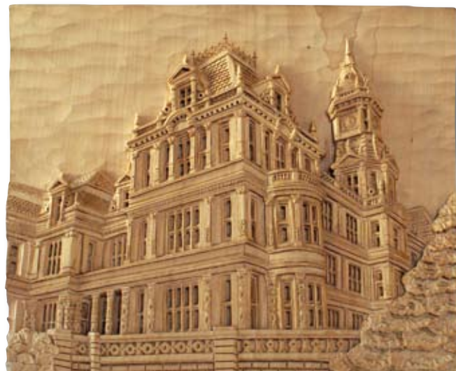
Crossley Heath Grammar School