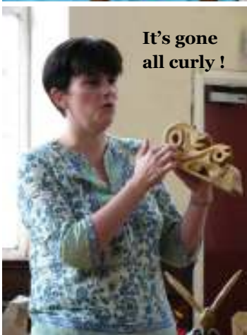
It's gone all curly!