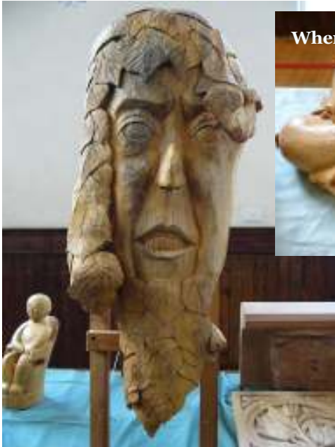
Where's my Mum?

Good job Dick only had two carvings on display or we could all have been asking for bed and breakfast. Well done Dick, you were the only one who actually seemed to enjoy getting up and talking about your carvings.