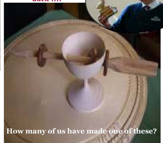
How many of us have made one of these?