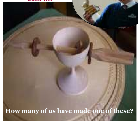
How many of us have made one of these?