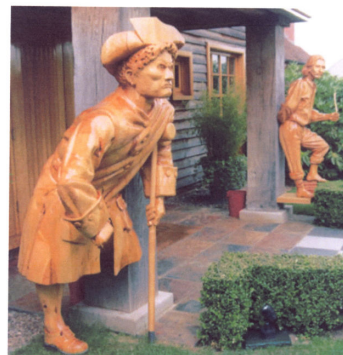
The above picture shows the figures of Robert Louis Stevenson and his creation Long John Silver adorning the entrance to "Highfield" at the home of Felix Dennis the Poet and publisher.