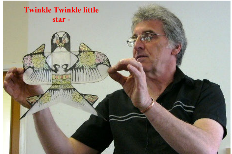
Twinkle Twinkle little star -