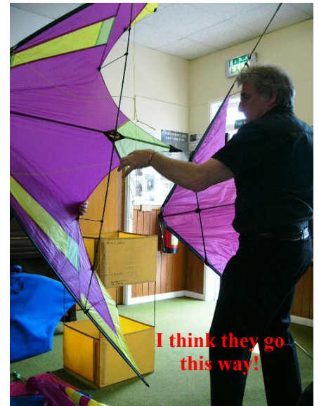
I think they go this way!