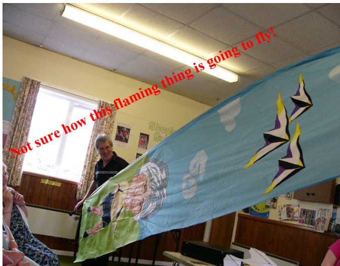
Not sure how this flaming thing is going to fly!