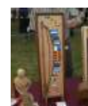
A very small selection of the carvings on display.