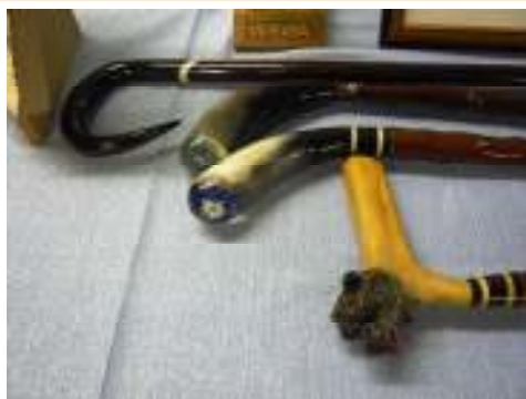
Malcolm Cooper's incredible stick ends.

I'm struggling to find anything more to report - so I will add in some nice photos!