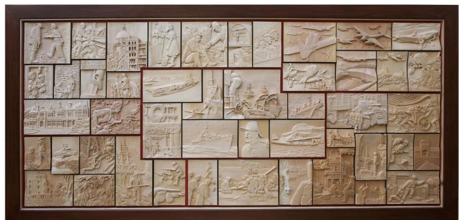
World War Two Panel