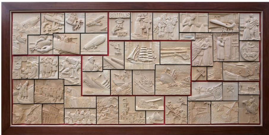
World War One Panel

Next year it would be advisable to have a period of consolidation in the club and getting back to applying ourselves to the normal running of things.