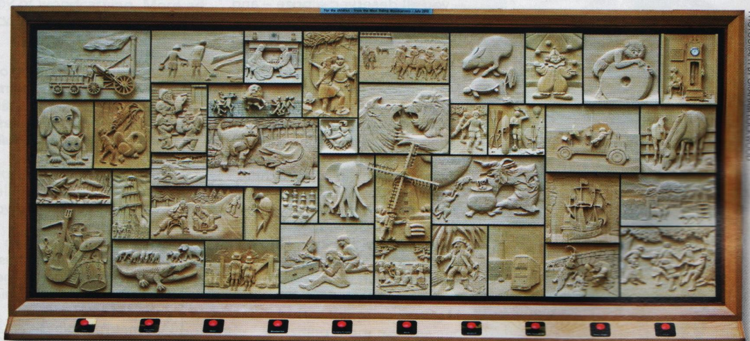
The wonderful panel, which was made especially for the Forget Me Not children's hospice