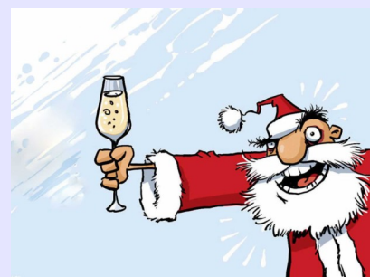
Coffee and Mince Pies