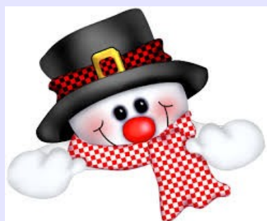
Coffee & Biscuits on arrival