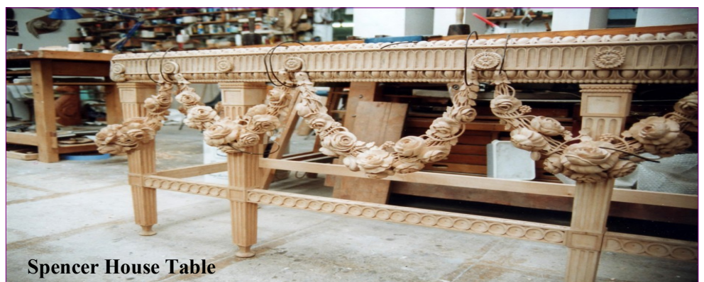
Spencer House Table